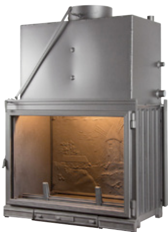
Multivision Hydro80 Single Sided

Hand crafted with raw materials to produce world class elegance and outstanding heating performance, the Seguin Multivision Hydro80 has been engineered to encapsulate your entire home heating solution. This sustainable heating solution delivers superior heat output, delivering heating via your in floor heating systems or radiator panels. The Seguin Multivision Hydro80 provides an efficient solution to your heating needs. Through versatility incorporated into simplicity this design is the ideal solution to heat your home comfortably.