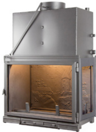
Multivision Hydro80 VL