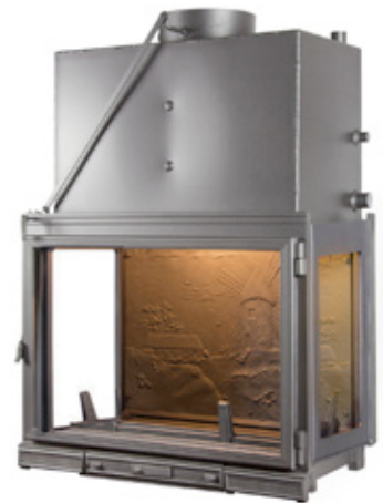
Multivision Hydro80 3V